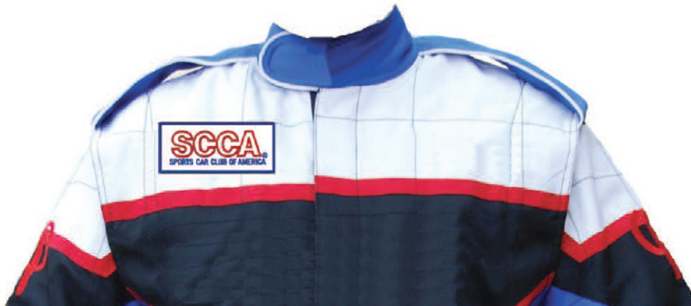
Figure 3 SCCA Uniform Patch (Right Side Preferred)